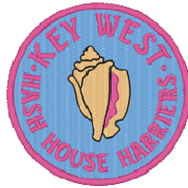
Hash house Harriers, Florida, USA