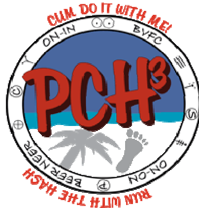
Panama City Hash House Harriers, Central America