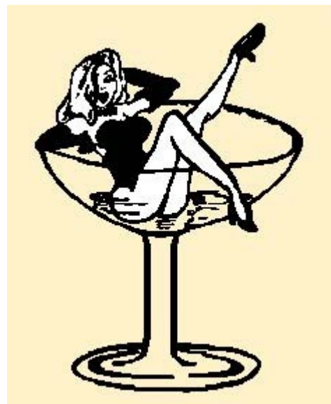
Adelaide Hash House Harriers