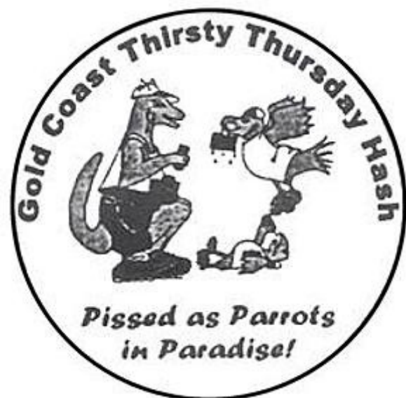
Gold Coast Thursday Hash House Harriers A mixed hash that run every Thursday @6.30pm.