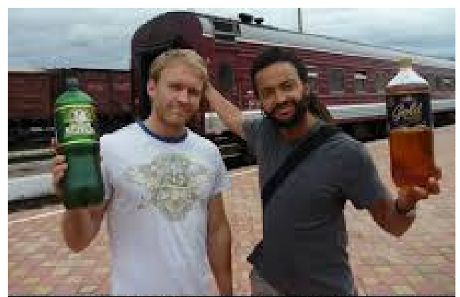
Beer wasn't considered alcohol in Russia until 2011. Before that, it was thought of as a soft drink. Throw 'em back, head to work, no big deal.