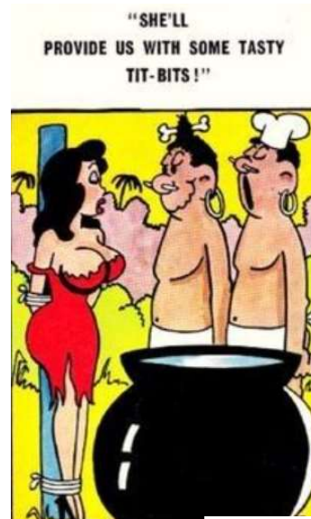
When Pink Bits and G String get old