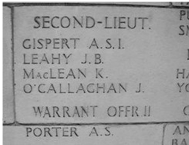
The headstone of "G"